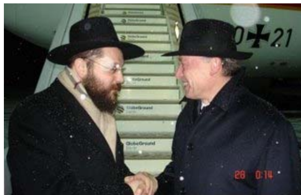
Germany - President Horst Kohler